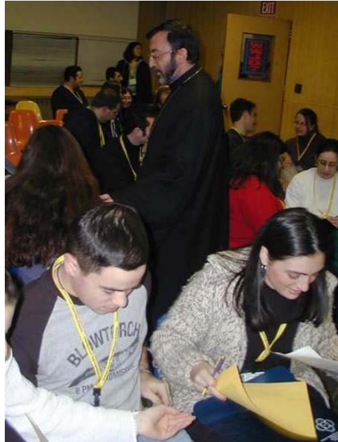
Our Primate, Abp. Khajag Barsamian, participating in a group discussion during Friday evening’s session.

Working in groups led by clergy and Central Council members, young adults gathered and discussed various ways to create programming that would cater to different aspects of service. A few different topics discussed were service to the sick, to peers, to the elderly, to Armenia, and to the youth.