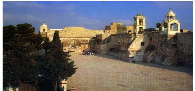
Church of the Nativity in Bethlehem

For the participants of the DYM 2000 Pilgrimage to Jerusalem, including members of the ACYOA Juniors and Seniors, the current fighting taking place in Jerusalem has had a personal impact. The holy places they visited, many of which are owned in part or entirely by the Armenian Patriarchate of Jerusalem, remain under siege as fighting rages. This violence has prompted discussion and prayer among all Armenians who have traveled to the Holy Land, especially the participants of the 2000 pilgrimage.