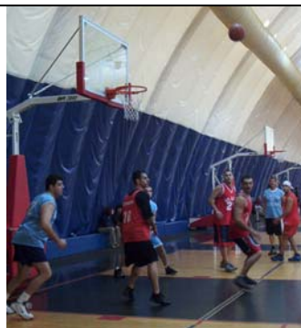
St. Vartan Cathedral vs. St. Leon