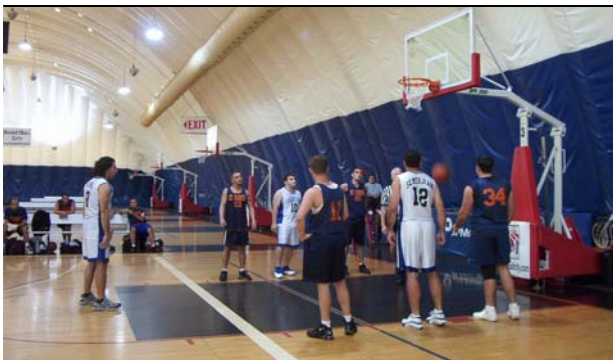
Sts. Sahag & Mesrob (l) vs. St. Sarkis

Look for the competition to return in May 2004 at Sports Weekend in Dallas, TX, and in October 2004 at the next Archbishop's Tournament in Cambridge, MA! Visit our website, www.acyoa.org , for more details about the tournament games.