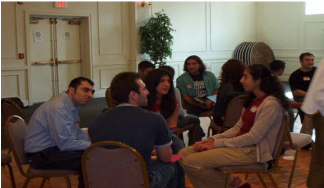
A group breakout session at the Mid-Atlantic Regional Conference.

For more information on the Southern Conference, send an e-mail to acyoa@armeniandiocese.org .