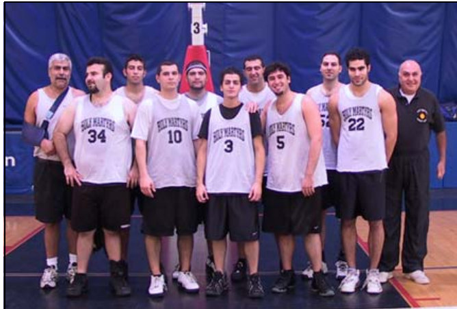
The 2003 Archbishop's Tournament and Sports Weekend Champion Holy Martyrs team.

NEW YORK—Another weekend of world-class athletic competition is complete. A new champion has been named. After a day of exciting matchups, the 2003 Sports Weekend champion Holy Martyrs team (Bayside, NY) beat out defending Archbishop's Tournament champion St. Vartan Cathedral (New York, NY) by one point, taking home the first place trophy. The 2003 Archbishop's