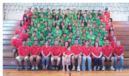
St. Vartan Camp 2003—Session A

Thank you to all ACYOA members who volunteered this summer as staff members at St. Vartan Camp, Hye Camp, and St. Nersess Summer Conferences! You serve as wonderful role models to future ACYOA members.