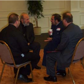
Members of the clergy in a discussion at the Mid-Atlantic Regional Conference.

Three of the four ACYOA Regional Conferences are complete, with the Southern Conference scheduled to take place on Saturday, November 22nd in Jacksonville, FL. These conferences were designed to allow ACYOA chapters to come together within their geographical region, and participate in fellowship while discussing their Armenian Christian faith and working together to strengthen their chapters. Program content included a Bible Study, a discussion led by clergy members on how to be a Christian in a non-Christian world, and workshops on how to keep chapters energetic.